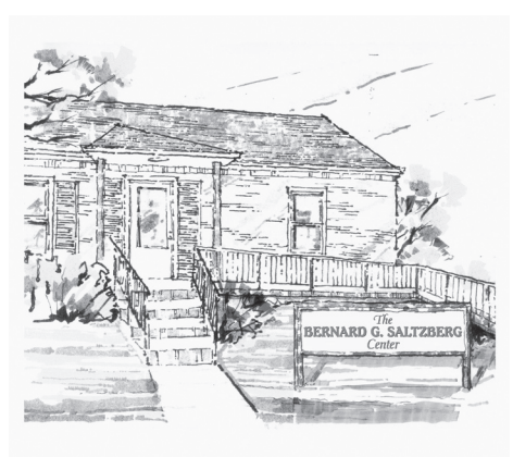
The Bernie Saltzberg Center on the Orchard Village campus will house Orchard Academy until the program expands.