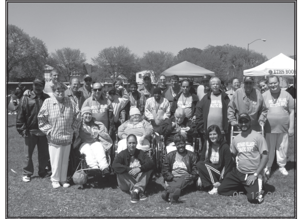
The athletes representing Orchard Village used the Special Olympics as one method of achieving important personal outcomes, including the realization of personal goals and interaction with other members of the community.