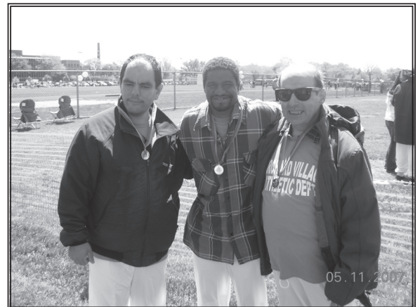
Medals all around!