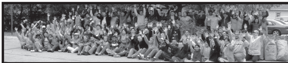
Motorola volunteers gathered around more than 50 bags of yard debris that they compiled while beautifying Orchard Village.

Under the direction of Orchard Village staff, Motorola volunteers planted over 1,000 bulbs, planted grass seed, and painted and conducted other landscaping activities to beautify the campus and make it more inviting to current and potential customers and donors.